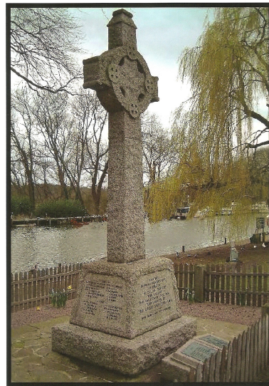
Thorpe St Andrew War Memorial